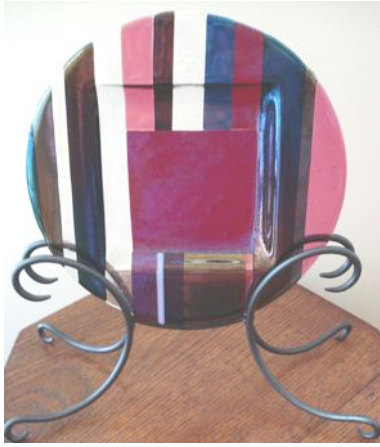
Comdy Pond's "Red Plate in Glass"