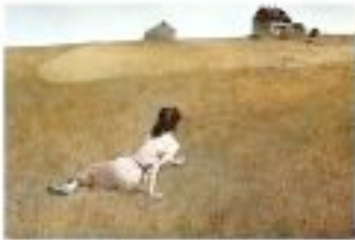
Christina's World – by Andrew Wyeth