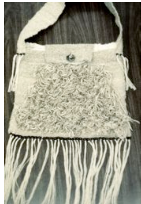
Weaving – Purse – Kay Collins