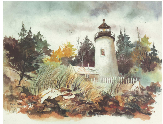
“Pemaquid Point Light, ME” - Gerry Wood

Remember the Guild is on Facebook. Try this link http://www.facebook.com/pages/Calvert-Artists-Guild/106227186074949 . Remember to bookmark the page!!