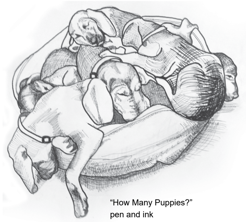
"How Many Puppies?" pen and ink