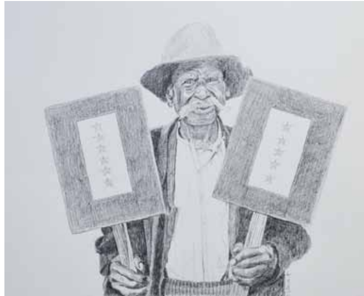
“Blue Star Father”