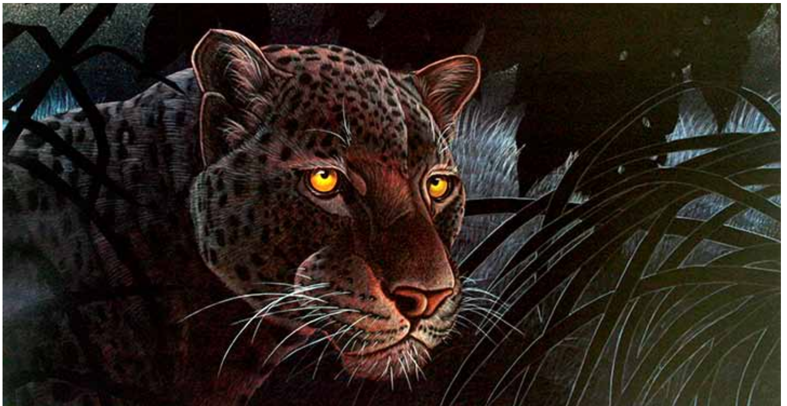
"Buck-A-Near", scratchboard by Carmelo Ciano