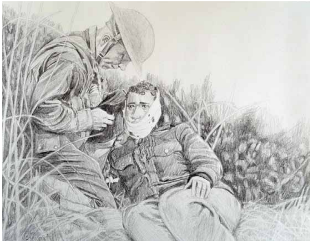
“Medic in the Field”