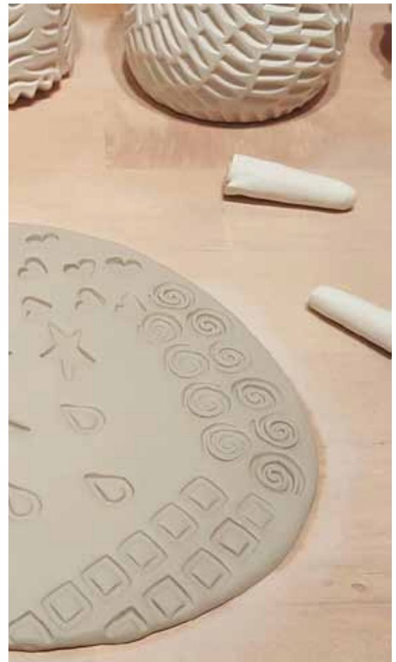
Impressions left by handmade bisqued clay stamps