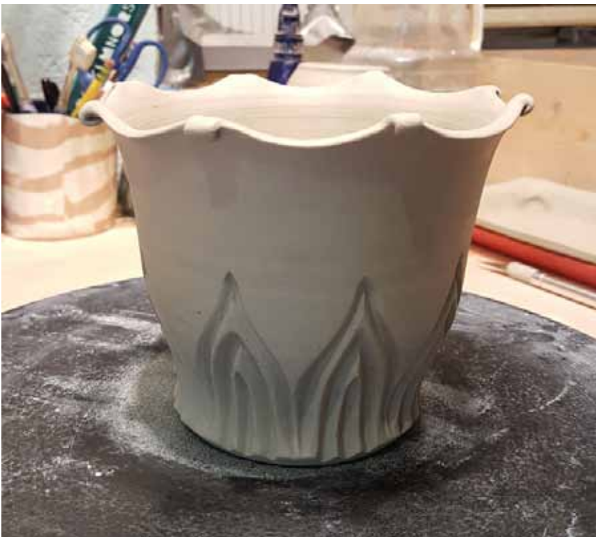
Carved Vessel w/ Altered Rim