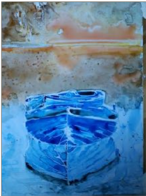
Donna Tizol Base Paintings