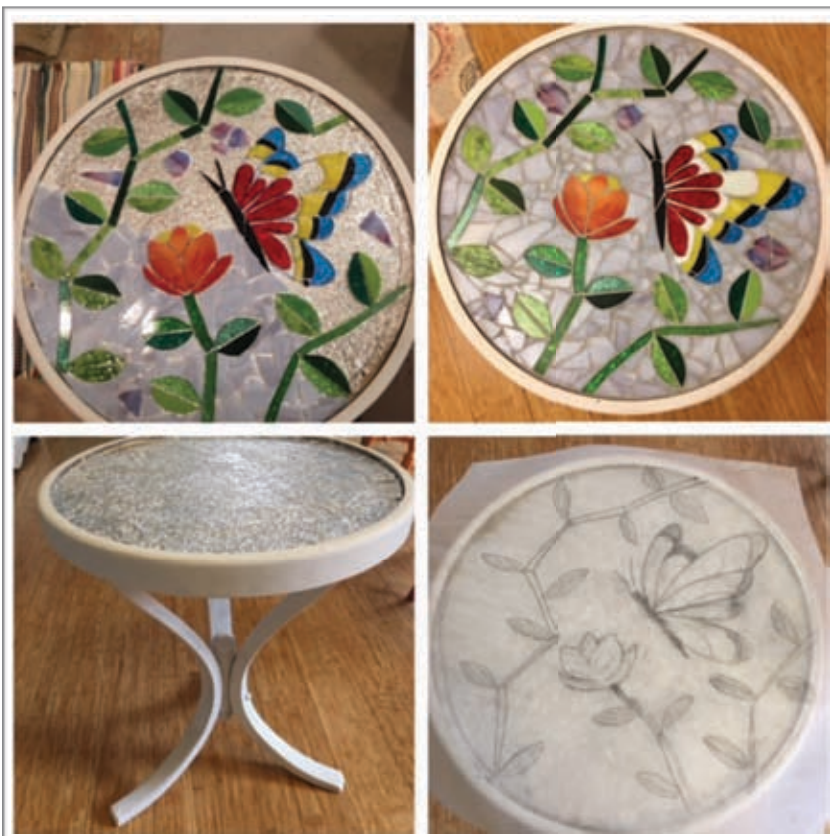
This is a $10 flea market find painted and topped with a glass mosaic. To add interest a layer of crinkled aluminum was glued under the translucent pieces of glass. Inspiration was taken from a chair with a vine fabric pattern by Joan Humphreys