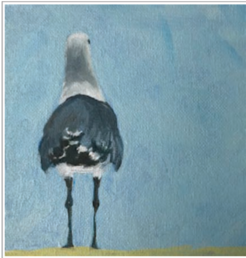
Seagull - titled "Dreaming" by Elaine Strong