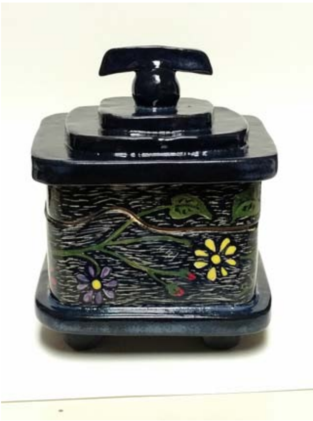
3-d Lidded ceramic box, sgraffito decorated, untitled by Lonnie Harkins