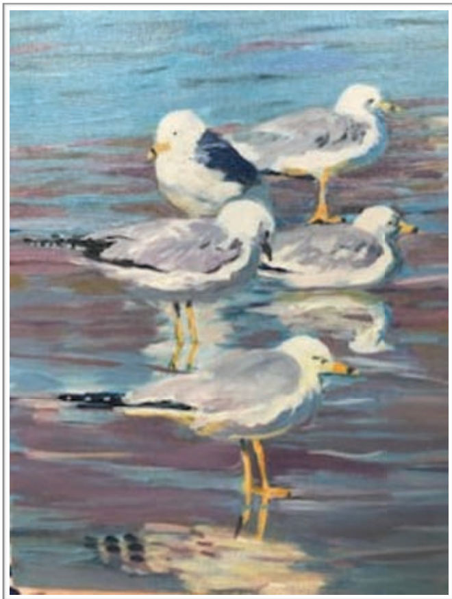
5 Gulls by Elaine Strong