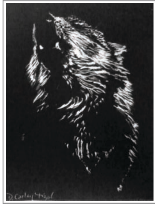
“Black Beauty” and “Call of the Wild” ‘5x7 scratchboard works by Donna Tizol