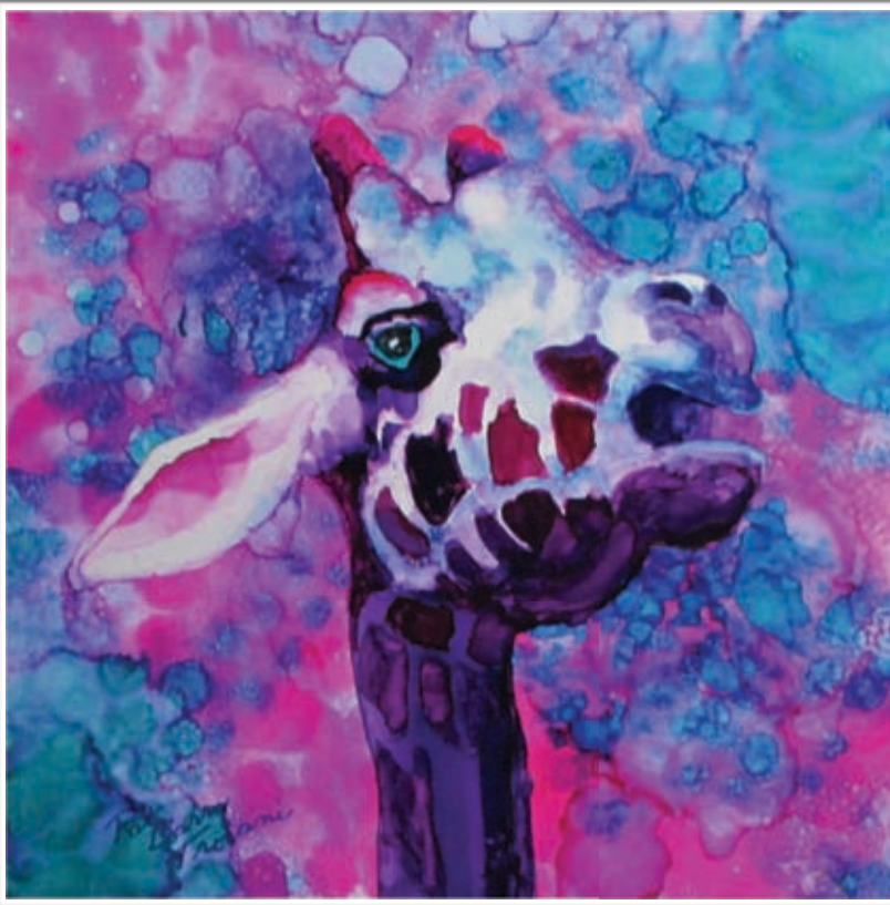
“What’s Your Problem” (Giraffe)