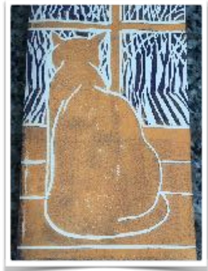
Linocut print of cat by Davy Strong