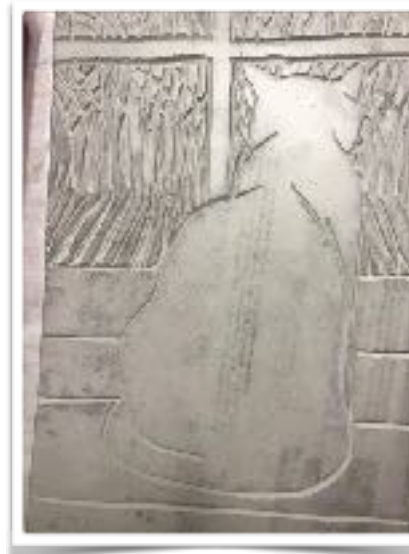
Linoleum block of cat