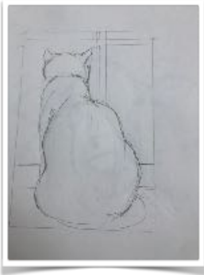
Preliminary sketch of a cat

Amazing art was made at the January Workshop at the Mt. Hope Community Center in Sunderland, MD