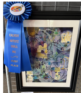
Mixed Media - Chatterboxed