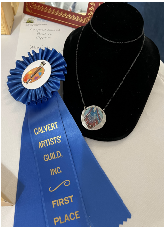
Jewelry - Midnight Fantasy