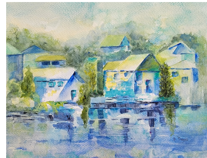
Watermedia - Waterfront Properties