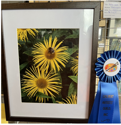
Photography - Daisies & Bee