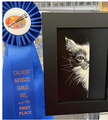
Drawing - The Stalker