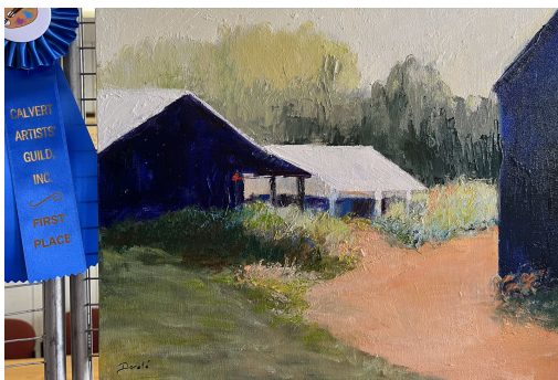
Oil - Purple Barn