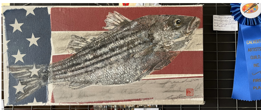
Printmaking - Star Striped Bass