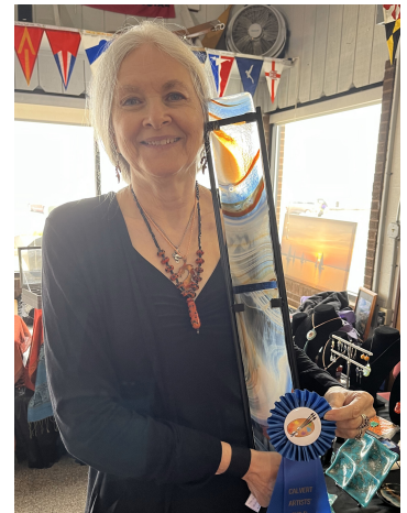
3D Art - Obelisk Agate