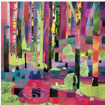
Best in Show -- Zekiah Swamp