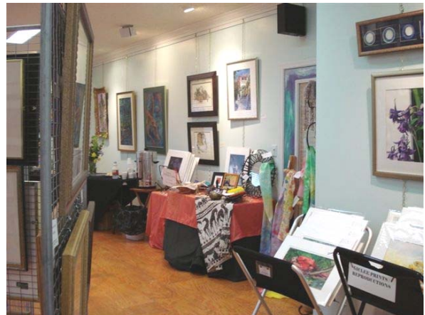
View of March 2009 Show set-up