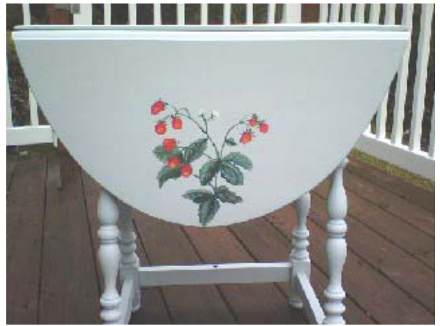
Debbie's painted drop-leaf table