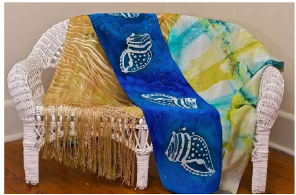
Betty Leppin – Painted Silk Scarves

(See registration form on separate page enclosed)