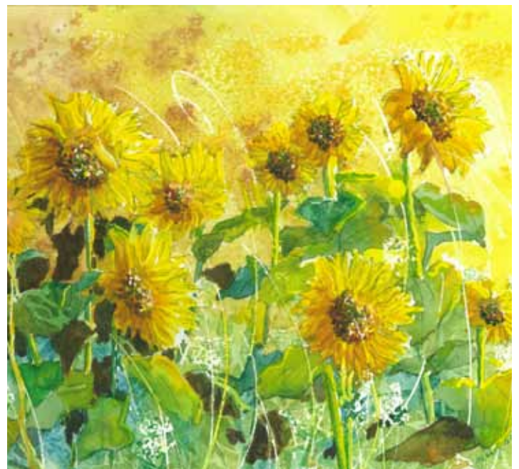
“Sunflowers” by Gerry Wood