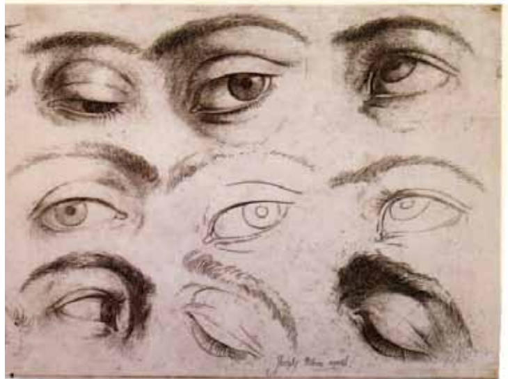
Study of Eyes

It's always a good idea to study the subforms of the face. Whenever you have a free moment, draw isolated views of the eyes, nose, lips, and ears from every direction. Soon you will build up a subconscious understanding of each feature.