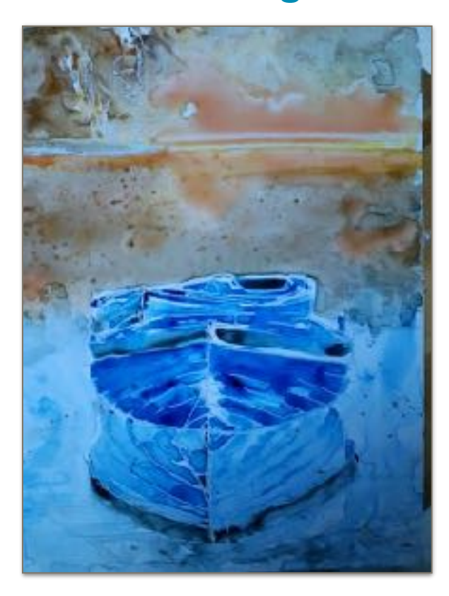
Donna Tizol Base Paintings